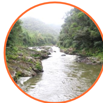
Area of Vangaindrano