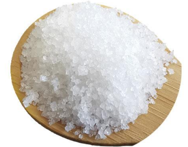
Fleur de Sel