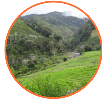
Area of Mananara/Maroantsetra