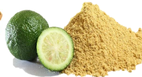
Dried Kaffir Lime