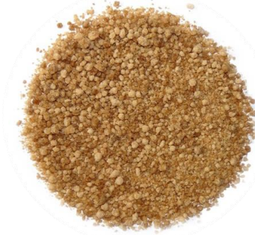
Artisanal Unrefined Sugar