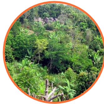
Area of Fenerive